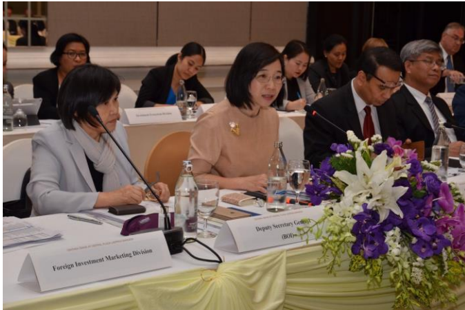
BOI Consultative meeting