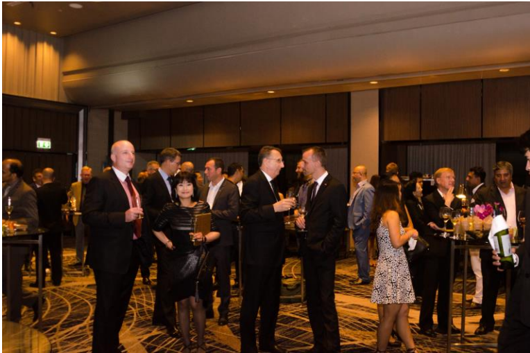
Joint Embassies and Chamber Networking